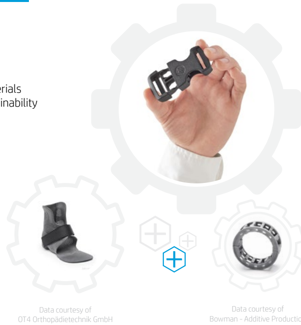
Data courtesy of OT4 Orthopädietechnik GmbH

Statements: 9 Biocompatibility, REACH, RoHS (for EU, Bosnia-Herzegovina, China, India, Japan, Jordan, Korea, Serbia, Singapore, Turkey, Ukraine, Vietnam), PAHs, Statement of Composition for Toy Applications