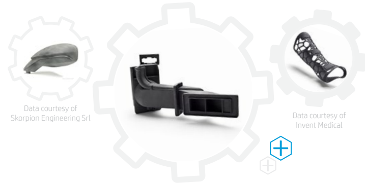
Data courtesy of Skorpion Engineering Srl