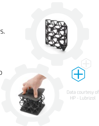
Data courtesy of HP - Lubrizol

Tested and approved solely for compatibility with HP Jet Fusion 3D printers 14