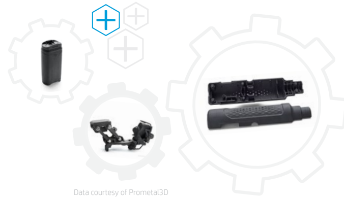
Data courtesy of Prometal3D

Statements: 9 Biocompatibility, REACH, RoHS (for EU, Bosnia-Herzegovina, China, India, Japan, Jordan, Korea, Serbia, Singapore, Turkey, Ukraine, Vietnam), PAHs, Statement of Composition for Toy Applications, UL 94 and UL 746A