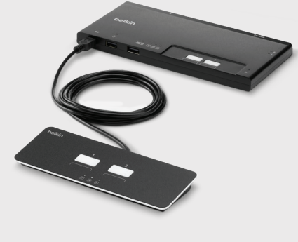
2-Port, Single-Head Modular Secure KVM Switch w/Remote F1DN102MOD-BA-4