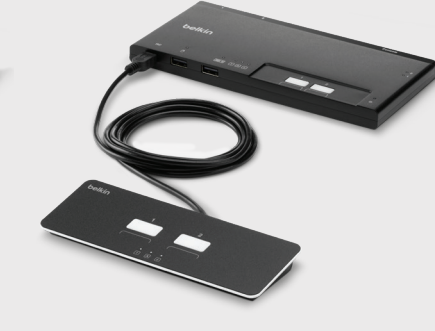
2-Port, Dual-Head Modular Secure KVM Switch w/Remote F1DN202MOD-BA-4