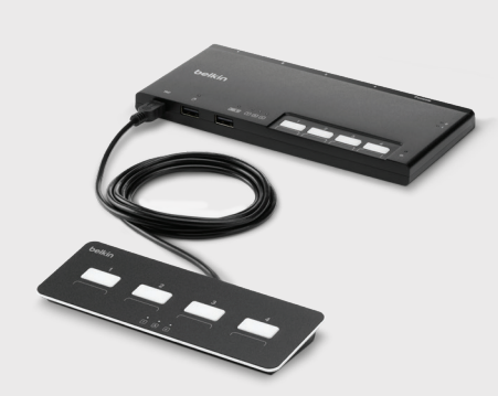
4-Port, Single-Head Modular Secure KVM Switch w/Remote F1DN104MOD-BA-4