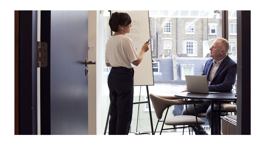
An Innovation Hub NS2 Labs is focused on the fusion between government, commercial and security communities.